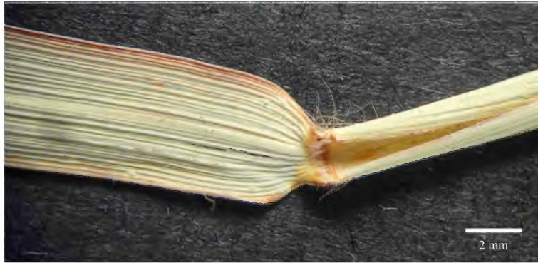
Fig. 2. Eulalia simonii . Ligule and adaxial leaf surface ( Ridley BES 00767 , PERTH).